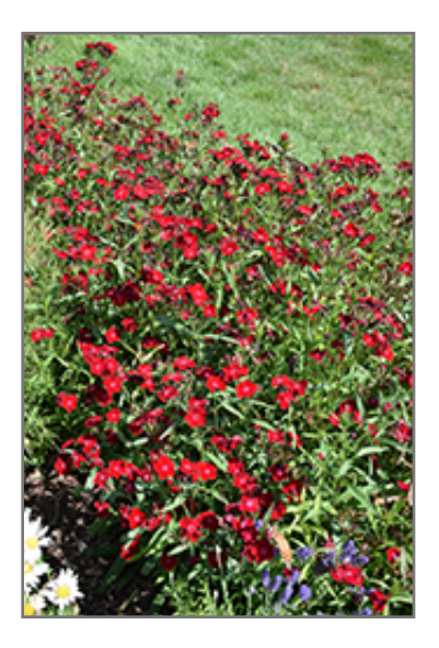
Rockin' Red Pinks in bloom

Rockin' Red Pinks is a fine choice for the garden, but it is also a good selection for planting in outdoor pots and containers. It can be used either as 'filler' or as a 'thriller' in the 'spiller-thriller-filler' container combination, depending on the height and form of the other plants used in the container planting. Note that when growing plants in outdoor containers and baskets, they may require more frequent waterings than they would in the yard or garden. Be aware that in our climate, most plants cannot be expected to survive the winter if left in containers outdoors, and this plant is no exception. Contact our experts for more information on how to protect it over the winter months.