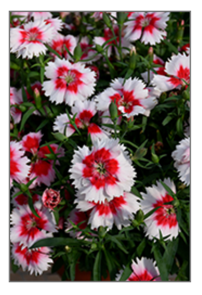
Super Parfait Red Peppermint Pinks flowers

Eye catching, frilly white flowers with vivid red centers rise above mounds of fine foliage on strong stems; great for flower arrangements; very floriferous with a tidy, uniform habit; sturdy, resilient and easy to grow; excellent in containers