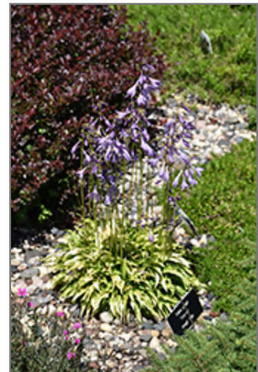
Bitsy Gold Hosta in bloom