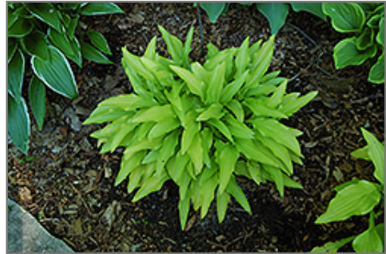
Bitsy Gold Hosta