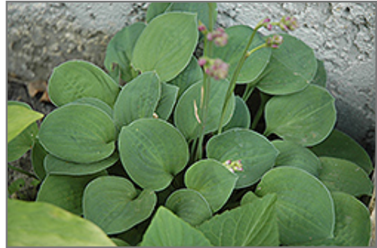
Baby Bunting Hosta foliage