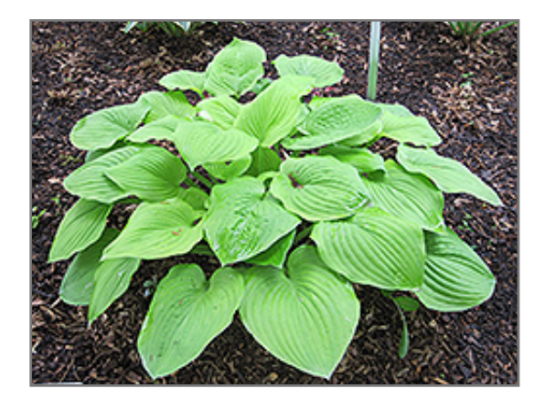
August Moon Hosta