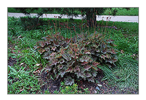
Silver Streak Foamy Bells