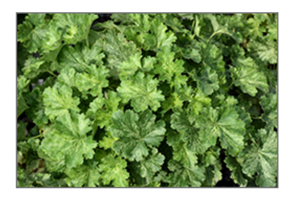
Snow Angel Coral Bells

Snow Angel Coral Bells will grow to be about 8 inches tall at maturity extending to 18 inches tall with the flowers, with a spread of 12 inches. When grown in masses or used as a bedding plant, individual plants should be spaced approximately 10 inches apart. Its foliage tends to remain low and dense right to the ground. It grows at a medium rate, and under ideal conditions can be expected to live for approximately 10 years. As an evegreen perennial, this plant will typically keep its form and foliage year-round.