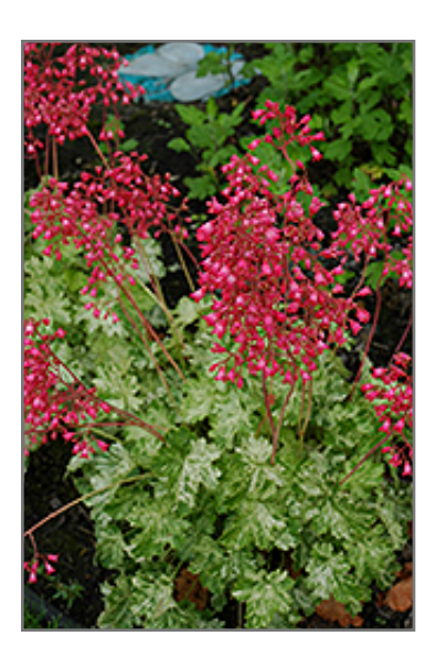
Snow Angel Coral Bells in bloom