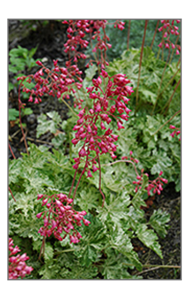
Snow Angel Coral Bells flowers

This is a relatively low maintenance plant, and should be cut back in late fall in preparation for winter. It is a good choice for attracting hummingbirds to your yard. It has no significant negative characteristics.