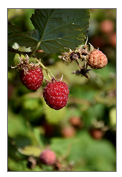
Caroline Raspberry fruit

Fall-bearing variety producing abundant tasty red fruit, improved disease resistance, prune canes to the ground in late fall; raspberries are quite shrubby looking and require careful placement in the landscape, regular pruning and protection from birds