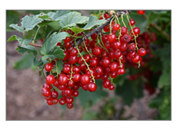
Red Currant fruit

A medium-sized shrub grown for its tasty red berries in summer, good for jam; quite stiff and upright, becoming looser with age; best for a reserved spot in the orchard or fruit garden, can be susceptible to mildew so allow for good air movement