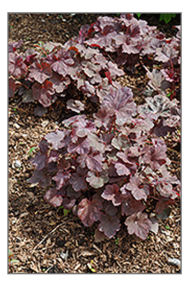
Ruby Veil Coral Bells

Ruby-purple leaves with silver veining and fuchsia undersides create tidy, low growing mounds; perfect for beds, borders and containers; small creamy white flowers appear during late spring and early summer months; drought tolerant once established