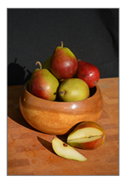
Seckel Pear fruit and flesh