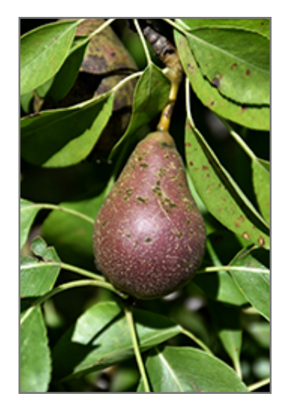
Seckel Pear fruit