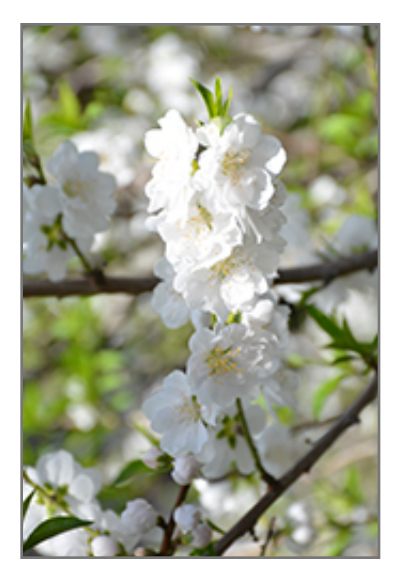
Early White Ornamental Peach flowers

This tree will require occasional maintenance and upkeep, and should only be pruned after flowering to avoid removing any of the current season's flowers. Gardeners should be aware of the following characteristic(s) that may warrant special consideration;