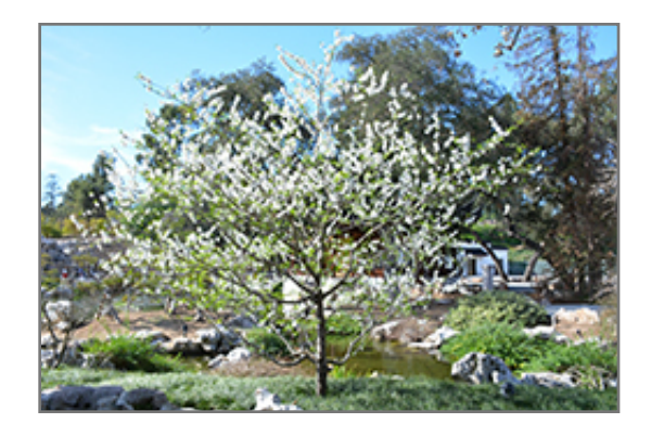
Early White Ornamental Peach in bloom