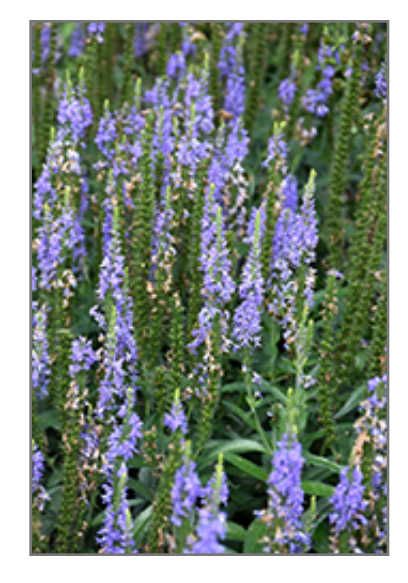
Moody Blues Sky Blue Speedwell flowers

Moody Blues Sky Blue Speedwell is recommended for the following landscape applications;