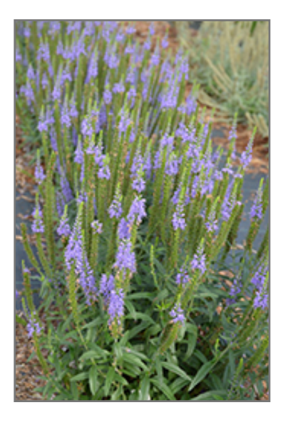
Moody Blues Sky Blue Speedwell in bloom