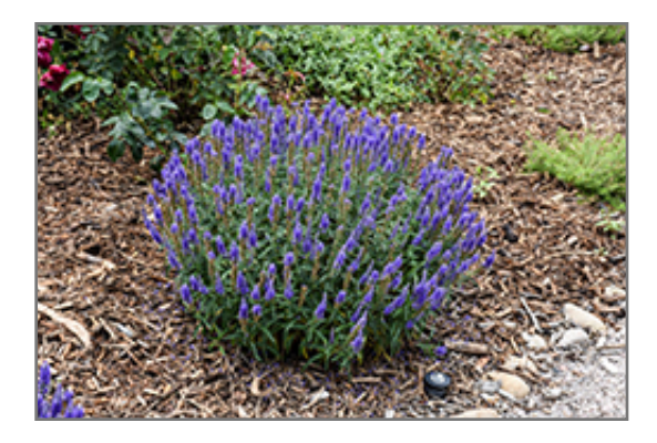
Moody Blues Dark Blue Speedwell in bloom