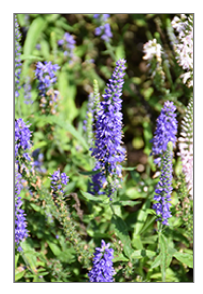
Moody Blues Dark Blue Speedwell flowers

Moody Blues Dark Blue Speedwell is a dense herbaceous evergreen perennial with an upright spreading habit of growth. Its relatively fine texture sets it apart from other garden plants with less refined foliage.