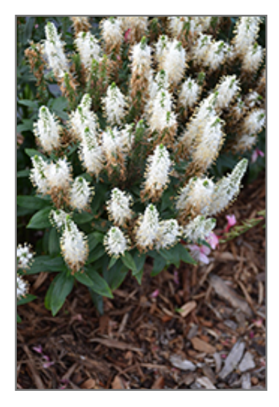
Vernique White Speedwell in bloom

Elegant rounded spikes of luminous white flowers cover this dense perennial; an excellent selection for a sunny garden or border edge