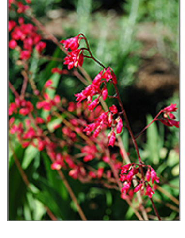
Northern Fire Coral Bells flowers

A low maintenance and easy to grow selection featuring medium green foliage growing in compact-mounds; tall flower spikes of ruby red blooms make an appearance from early to mid summer; suitable for cutting; excellent choice for beds, bords and containers