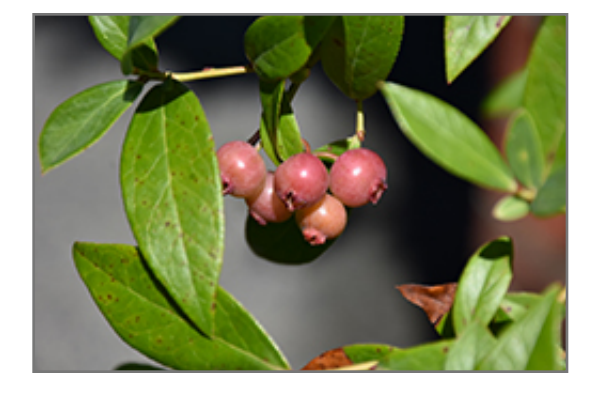
Pink Lemonade Blueberry fruit

Pink Lemonade Blueberry features dainty clusters of white bell-shaped flowers with shell pink overtones hanging below the branches from early to mid spring. It has green deciduous foliage. The glossy oval leaves turn outstanding shades of gold and in the fall. It features an abundance of magnificent rose berries from early to mid summer.