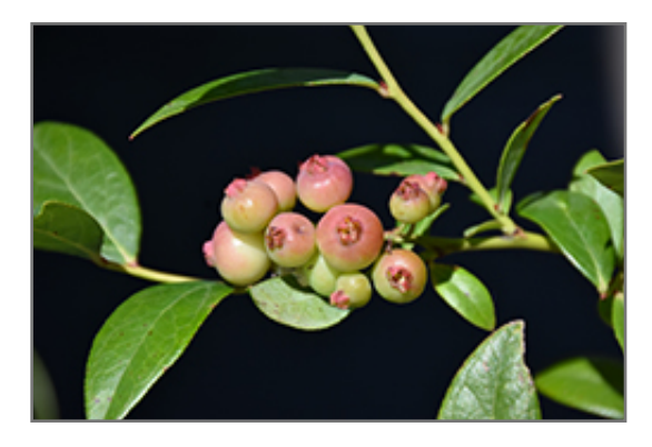
Pink Lemonade Blueberry fruit