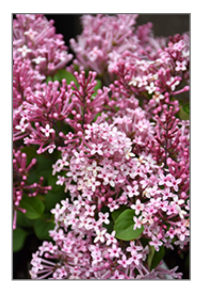
Scent And Sensibility Pink Lilac flowers

Scent And Sensibility Pink Lilac will grow to be about 3 feet tall at maturity, with a spread of 5 feet. It tends to fill out right to the ground and therefore doesn't necessarily require facer plants in front. It grows at a slow rate, and under ideal conditions can be expected to live for approximately 30 years.