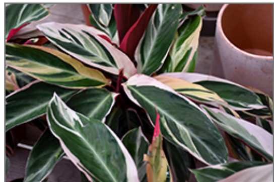
Triostar Stromanthe foliage