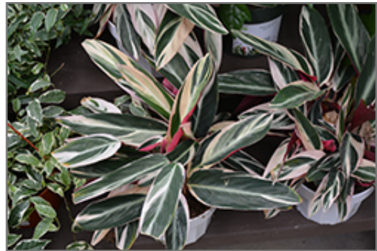
Triostar Stromanthe in full

This is a dense spreading evergreen houseplant with an upright spreading habit of growth. Its relatively coarse texture stands it apart from other indoor plants with finer foliage. This plant should not require much pruning, except when necessary to keep it looking its best.