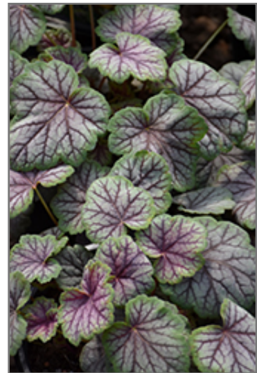
Green Spice Coral Bells foliage