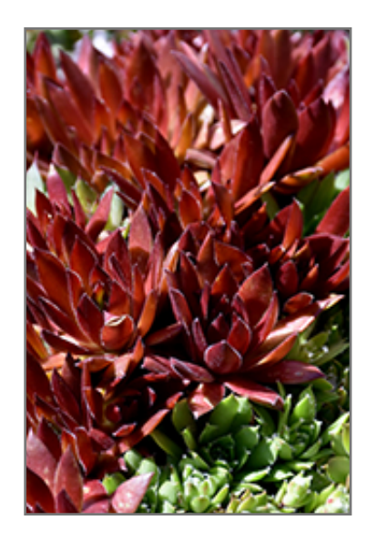
Red Rubin Hens And Chicks foliage

This plant will require occasional maintenance and upkeep, and should not require much pruning, except when necessary, such as to remove dieback. Deer don't particularly care for this plant and will usually leave it alone in favor of tastier treats. Gardeners should be aware of the following characteristic(s) that may warrant special consideration;