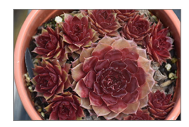
Red Rubin Hens And Chicks