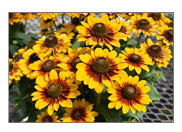
Toto Rustic Coneflower flowers

This dwarf variety produces large, semi-double blooms with rustic maroon-red inner rings and brown cones; makes an outstanding cut flower; deadhead for re-blooming; drought tolerant once established; wonderful along borders or in containers