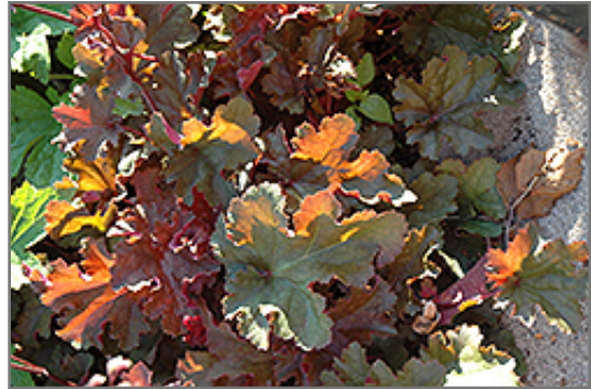
Chocolate Ruffles Coral Bells foliage

Chocolate Ruffles Coral Bells is a fine choice for the garden, but it is also a good selection for planting in outdoor pots and containers. With its upright habit of growth, it is best suited for use as a 'thriller' in the 'spiller-thriller-filler' container combination; plant it near the center of the pot, surrounded by smaller plants and those that spill over the edges. Note that when growing plants in outdoor containers and baskets, they may require more frequent waterings than they would in the yard or garden. Be aware that in our climate, most plants cannot be expected to survive the winter if left in containers outdoors, and this plant is no exception. Contact our experts for more information on how to protect it over the winter months.