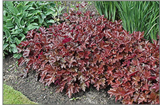
Chocolate Ruffles Coral Bells

This is a relatively low maintenance plant, and should be cut back in late fall in preparation for winter. It is a good choice for attracting hummingbirds to your yard. It has no significant negative characteristics.