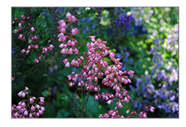
Chatterbox Coral Bells flowers