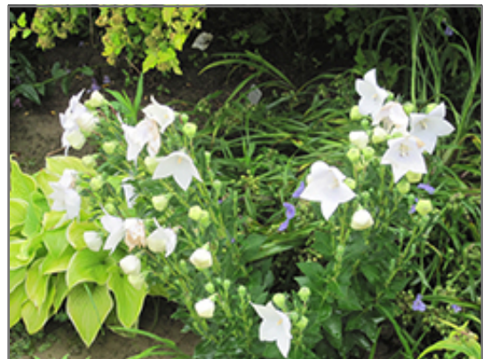
Astra White Balloon Flower in bloom