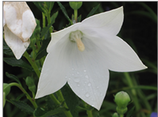
Astra White Balloon Flower flowers