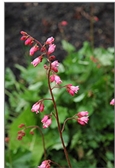
Brandon Pink Coral Bells flowers