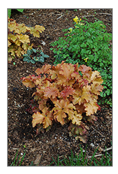
Amber Waves Coral Bells

This is a relatively low maintenance plant, and should be cut back in late fall in preparation for winter. It is a good choice for attracting hummingbirds to your yard. It has no significant negative characteristics.