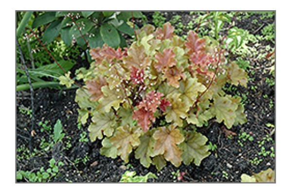
Amber Waves Coral Bells in bloom