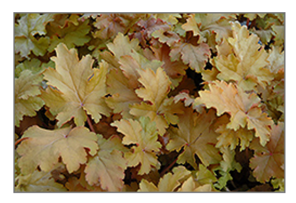
Amber Waves Coral Bells foliage

Amber Waves Coral Bells will grow to be only 6 inches tall at maturity extending to 12 inches tall with the flowers, with a spread of 12 inches. When grown in masses or used as a bedding plant, individual plants should be spaced approximately 10 inches apart. Its foliage tends to remain low and dense right to the ground. It grows at a medium rate, and under ideal conditions can be expected to live for approximately 10 years. As an evegreen perennial, this plant will typically keep its form and foliage year-round.