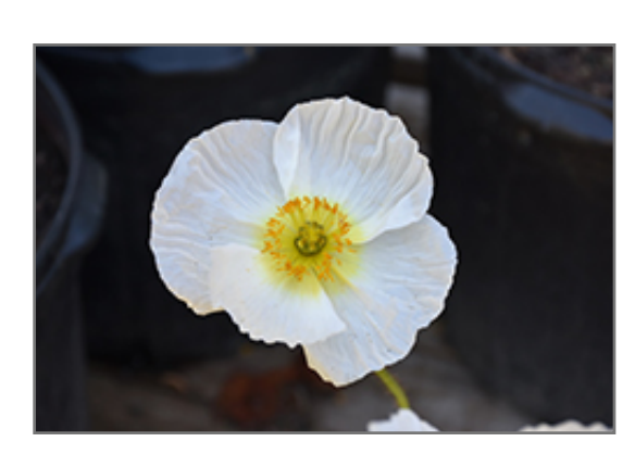
Champagne Bubbles White Poppy flowers

A clump-forming self-seeding selection offering a display of color, with large plate-like white flowers on strong stems; very pretty, with a long-lasting garden performance