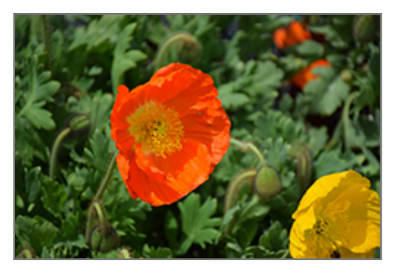
Champagne Bubbles Orange Poppy flowers