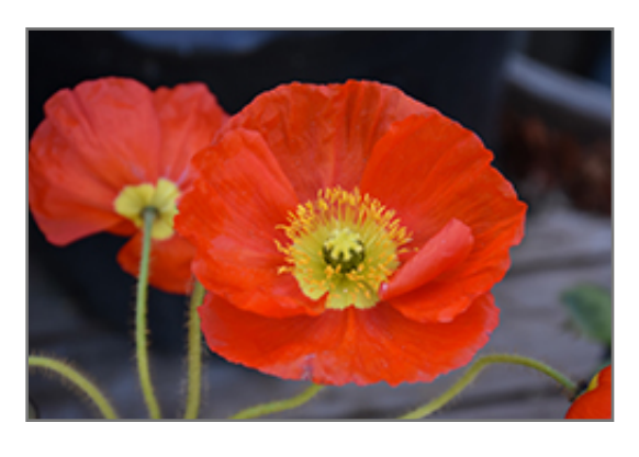
Champagne Bubbles Orange Poppy flowers

Champagne Bubbles Orange Poppy features showy orange round flowers with red overtones and buttery yellow eyes at the ends of the stems from late spring to mid fall. The flowers are excellent for cutting. Its tomentose ferny leaves remain bluish-green in colour throughout the season.