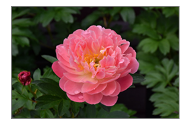
Pink Hawaiian Coral Peony flowers