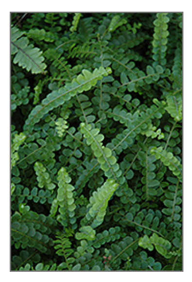
Lemon Buttons Fern foliage

Smallest of the Boston ferns; attractive, tiny golden-green leaflets on compact, dark green arching stems; an impressive groundcover for a woodland area; great in hanging baskets or containers, for indoors or out