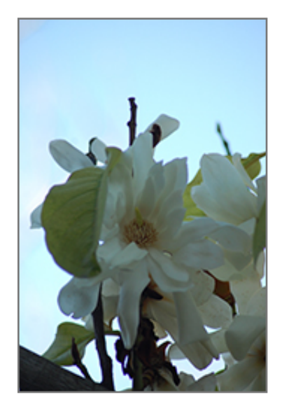
Silver Cloud Magnolia flowers