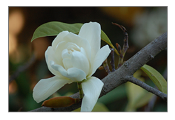
Silver Cloud Magnolia flowers