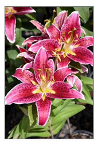
Lily Looks Sunny Grenada Lily flowers

A highly desired lily producing huge dark burgundy blooms with bright white edges, in late summer; flowers are heavily fragrant, and upright to outward facing; excellent for border plantings, containers and walkways