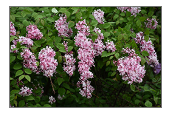
Superba Littleleaf Lilac flowers

This is a relatively low maintenance shrub, and should only be pruned after flowering to avoid removing any of the current season's flowers. It is a good choice for attracting butterflies to your yard. It has no significant negative characteristics.