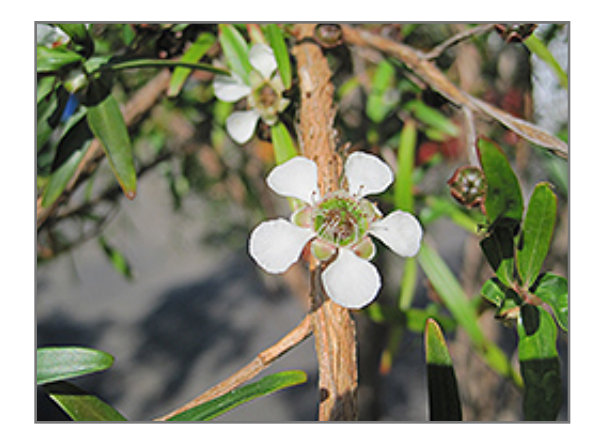
Lemon Scented Tea-Tree flowers