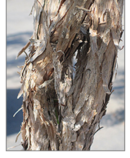
Lemon Scented Tea-Tree bark

Lemon Scented Tea-Tree will grow to be about 20 feet tall at maturity, with a spread of 15 feet. It has a low canopy with a typical clearance of 1 foot from the ground, and is suitable for planting under power lines. It grows at a medium rate, and under ideal conditions can be expected to live for 40 years or more.