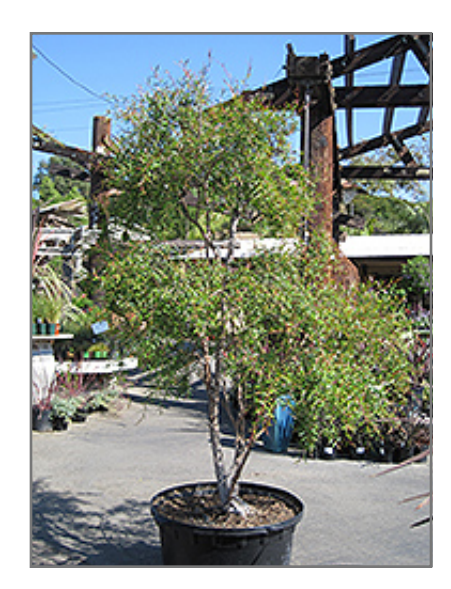
Lemon Scented Tea-Tree

Lemon Scented Tea-Tree is a dense multi-stemmed evergreen tree with an upright spreading habit of growth. Its relatively fine texture sets it apart from other landscape plants with less refined foliage.