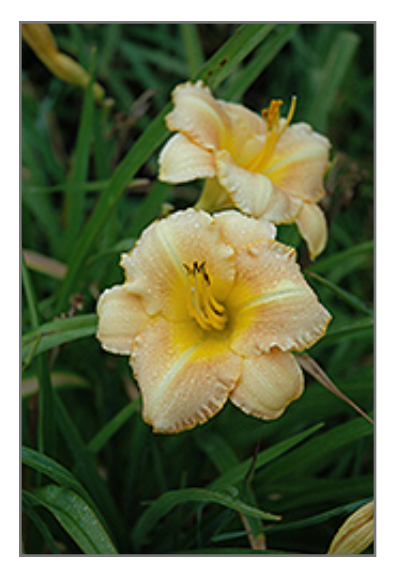
Taiga Sweet Dancer Daylily flowers

Beautiful soft peach, ruffled trumpets with yellow throats and white midribs; slender, arching green foliage; early midseason bloomer, excellent for borders, beds and containers; low maintenance and drought tolerant once established