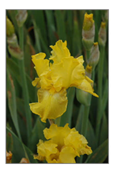
Well Endowed Iris flowers

This beautiful tall iris produces fragrant, golden yellow blooms with white flares below the beards; a stunning addition to the perennial border; fall reblooming; will quickly form dense colonies