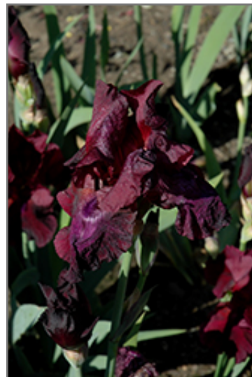
Fortunate Son Iris flowers