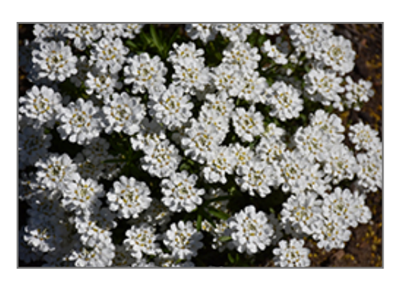
Whiteout Candytuft flowers

This improved variety has dense branching and more uniform flowering; features a froth of pure white flowers in spring, and very fine evergreen foliage for the rest of the year, benefits from snow cover; a dramatic mass planting