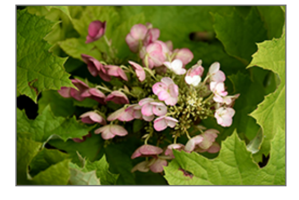
Amethyst Hydrangea flowers

A choice compact garden or massing shrub featuring large showy spikes of flowers which emerge white and quickly turn wine red; interesting deep green foliage with burgundy fall color, and papery bark; somewhat coarse in appearance, best used in groupings