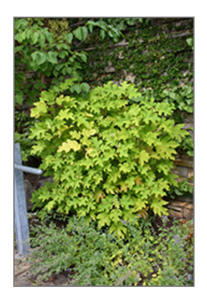
Amethyst Hydrangea

Amethyst Hydrangea is recommended for the following landscape applications;