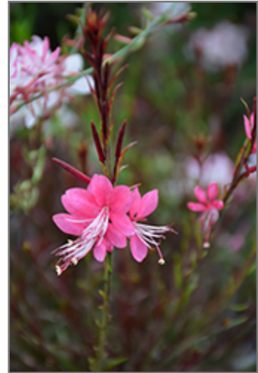
Passionate Rainbow Petite Gaura flowers

Passionate Rainbow Petite Gaura is recommended for the following landscape applications;