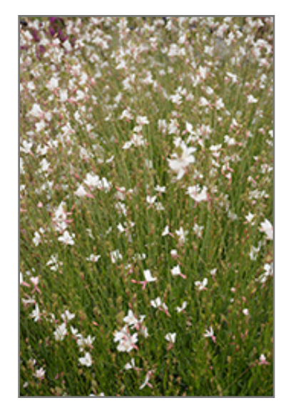
Geyser White Gaura in bloom