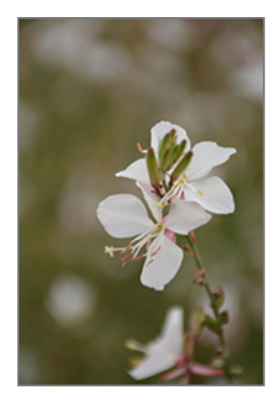
Geyser White Gaura flowers

Geyser White Gaura is recommended for the following landscape applications;