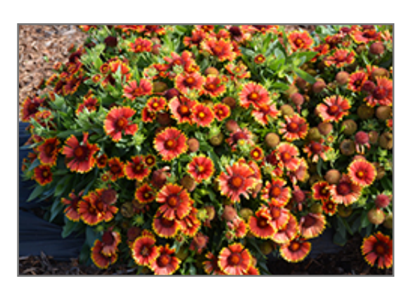
Sunset Cutie Blanket Flower in bloom