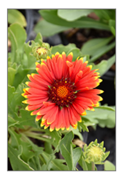
Sunset Cutie Blanket Flower flowers

Sunset Cutie Blanket Flower is a dense herbaceous perennial with a mounded form. Its relatively fine texture sets it apart from other garden plants with less refined foliage.