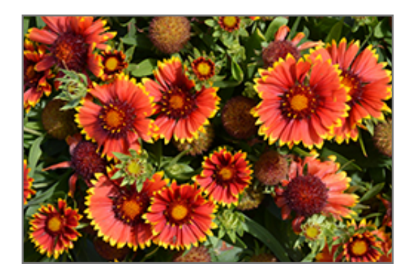
Sunset Cutie Blanket Flower flowers