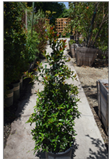
Monterey Bay Brush Cherry