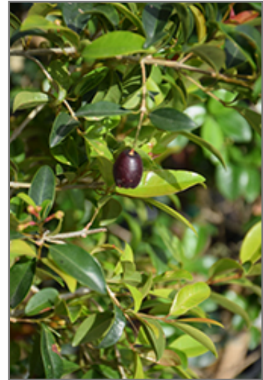
Monterey Bay Brush Cherry fruit

Monterey Bay Brush Cherry is a fine choice for the yard, but it is also a good selection for planting in outdoor pots and containers. Its large size and upright habit of growth lend it for use as a solitary accent, or in a composition surrounded by smaller plants around the base and those that spill over the edges. It is even sizeable enough that it can be grown alone in a suitable container. Note that when grown in a container, it may not perform exactly as indicated on the tag - this is to be expected. Also note that when growing plants in outdoor containers and baskets, they may require more frequent waterings than they would in the yard or garden. Be aware that in our climate, most plants cannot be expected to survive the winter if left in containers outdoors, and this plant is no exception. Contact our experts for more information on how to protect it over the winter months.