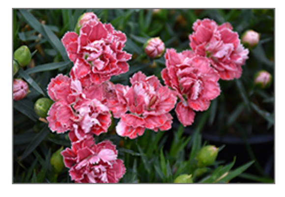
SuperTrouper Red and White Carnation flowers