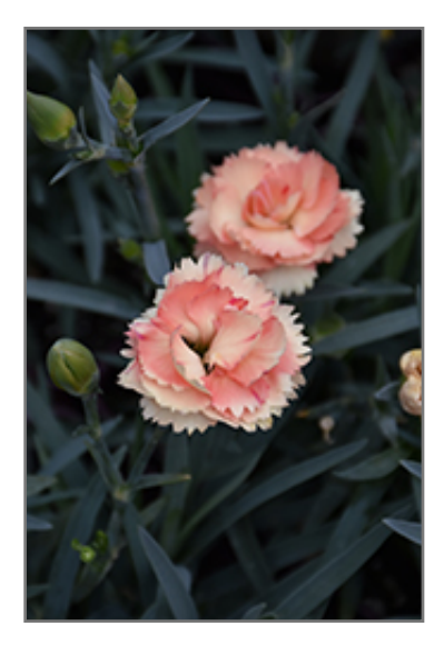
SuperTrouper Orange Carnation flowers

This is a relatively low maintenance plant, and is best cleaned up in early spring before it resumes active growth for the season. It is a good choice for attracting bees and butterflies to your yard, but is not particularly attractive to deer who tend to leave it alone in favor of tastier treats. It has no significant negative characteristics.