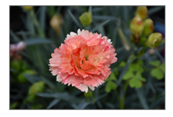
SuperTrouper Orange Carnation flowers