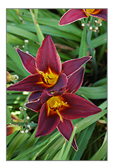
Starling Daylily flowers

Deep burgundy to dark purple blooms with stunning yellow throats show off against arching green foliage; early to mid season blooms; an elegant addition to beds, borders and containers; easy to grow and low maintenance, good for any gardener