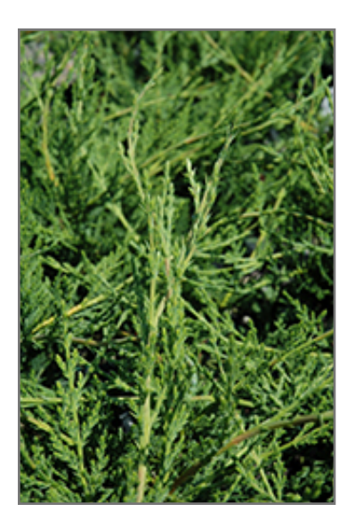
Leighton Green Leyland Cypress foliage