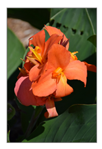
Cannova Orange Shades Canna flowers

This plant should only be grown in full sunlight. It requires an evenly moist well-drained soil for optimal growth, but will die in standing water. It is not particular as to soil pH, but grows best in rich soils. It is highly tolerant of urban pollution and will even thrive in inner city environments, and will benefit from being planted in a relatively sheltered location. Consider applying a thick mulch around the root zone in winter to protect it in exposed locations or colder microclimates. This particular variety is an interspecific hybrid. It can be propagated by division; however, as a cultivated variety, be aware that it may be subject to certain restrictions or prohibitions on propagation.