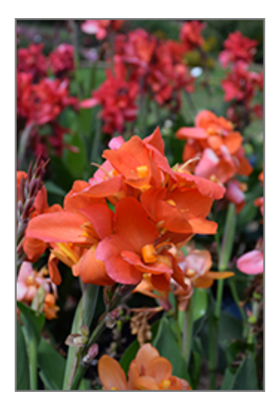
Cannova Orange Shades Canna flowers