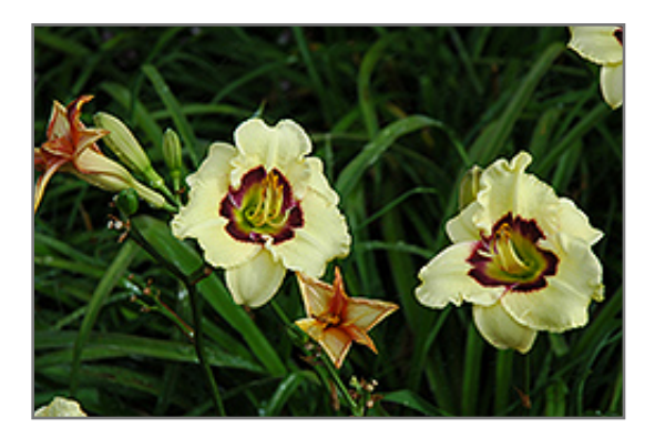
Siloam Doodlebug Daylily flowers